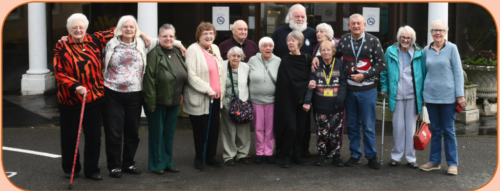
Christmas at the Durrant House Hotel